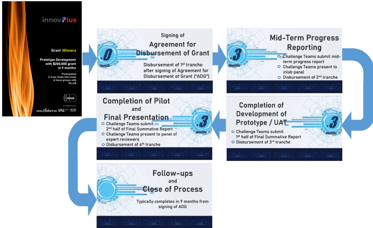
Diagram 2 - innovPlus Prototyping and Pilot Testing Phase Process Flow