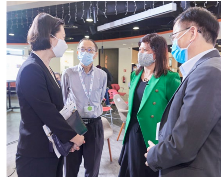
Ms Gan Siow Huang, Minister of State for Education and Manpower (left), guest-of-honour at iN.LAB's fifth anniversary

IAL will play an integral role in developing and levelling training providers' skills and capabilities as the sector goes digital. IAL's innovation arm, iN.LAB, continues to be the anchor facility providing a suite of programmes dedicated to exploring innovative learning and development solutions for digital possibilities.