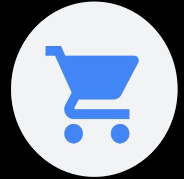
Digital Marketing & E-commerce

7 in 10 certificate graduates have reported a positive impact on their career