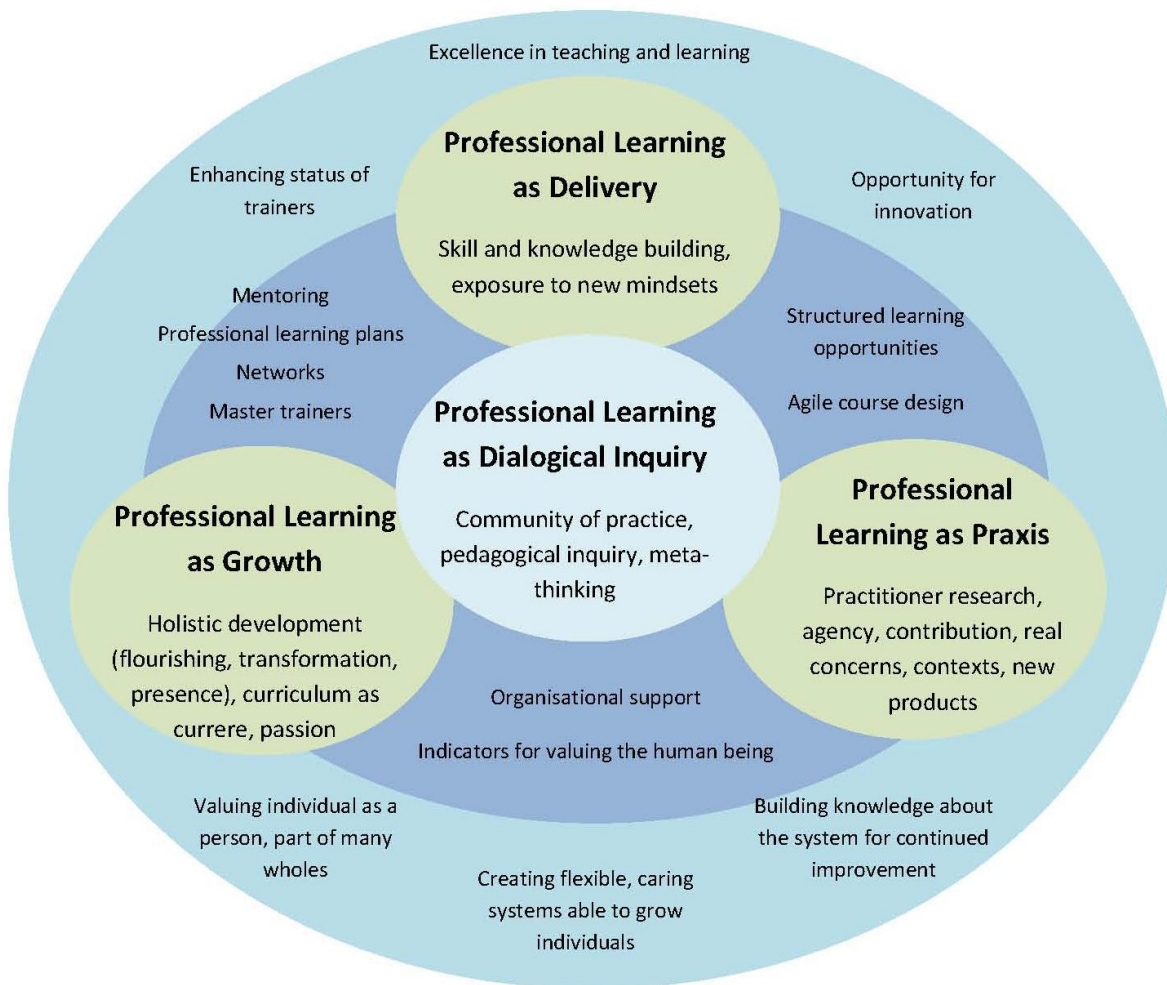
Figure 6: Professional Learning

As the 2009 ASEM LLL dialogue noted, professional development in Asia and Europe for adult educators “address the most important problem fields we will be facing in the future and in which practical political solutions need to be found and new perspectives identified” (ASEM, 2009).