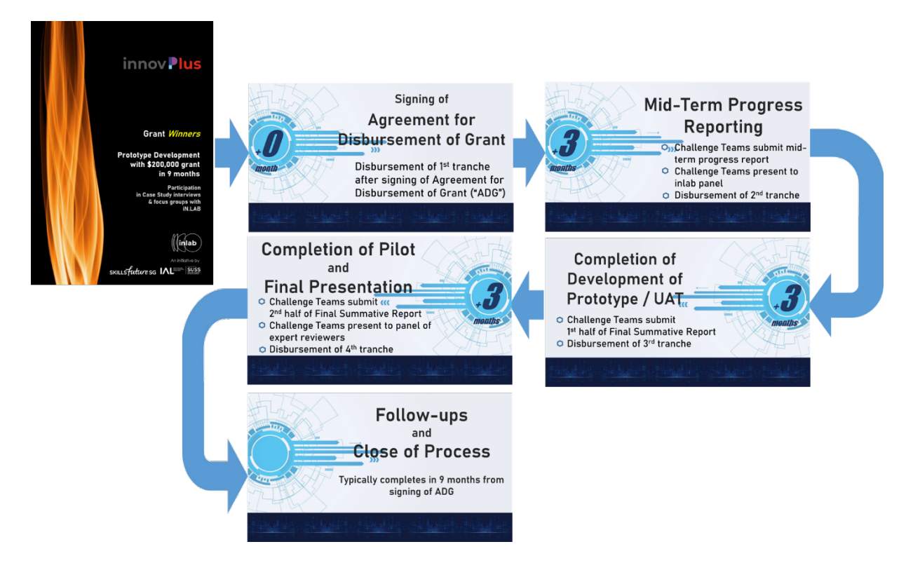
Diagram 2 - innovPlus Prototyping and Pilot Testing Phase Process Flow

9. Depending on the prevailing implementation challenges and needs, innovPlus Secretariat reserves the right to amend and change the processes with approval from Director of Innovation Centre, that complies with the intent and spirit of innovPlus.