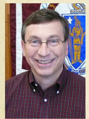
University of Massachusetts, Amherst

A Pilot Research Project to measure envisaged effects of tool